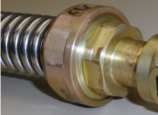
Figure 9: (after the test)

Slight discoloration of the samples due to the permanent overheating. No signs of leakage