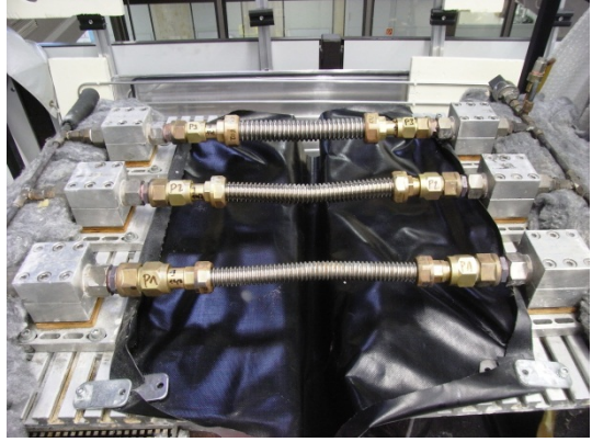
Figure 6: (after the test)

Tests samples on the test rig, after the test procedure has been accomplished. No leakage was observed. The deformation of the tubes is a result of the test procedure and does not affect the result of the test.