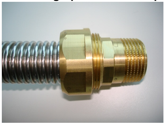
Figure 2: (before test start) Fast coupling system before tightening.