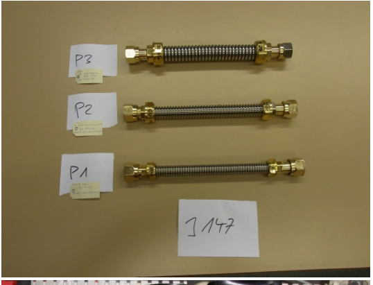
Figure 4: (before test start)

For the installation of the samples on the test rig additional adapters (orange circle) made by another manufacturer have to be applied. These un-plated brass adapters are not part of the test samples.