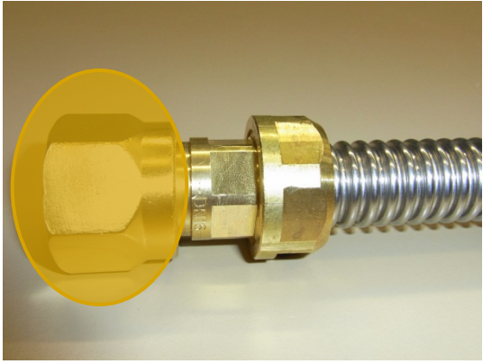
Figure 3: (before test start)

For the installation of the samples on the test rig additional adapters (orange circle) made by another manufacturer have to be applied. These un-plated brass adapters are not part of the test samples.