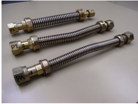
Figure 7: (after the test)

Tests samples on the test rig, after the test procedure has been accomplished. No leakage was observed. The deformation of the tubes is a result of the test procedure and does not affect the result of the test.