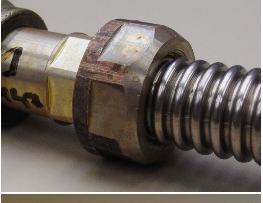
Figure 8: (after the test)

Test samples removed from the test rig. The deformation of the test tubes is permanent. No visible damage of the samples.