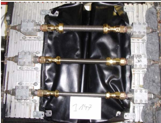
Figure 5: (before test start)

P3: DN25 (Radio Frequency Systems, PW025-AFL)