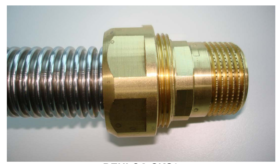
BEULCO SKS2 Fast coupling system for corrugated stainless steel pipes

Coupling system for solar thermal applications. Test according to SPF test procedure: Test class A1